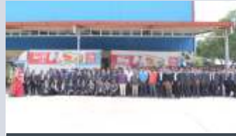
Big Mishra Plant, Dharwad