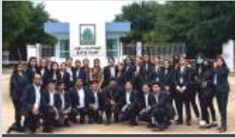
Tata Motors, Dharwad Plant