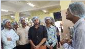
Akshaypatra (Karnataka's Largest Kitchen)