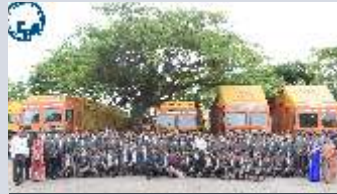
VRL, Varur (Asia's Largest Logistic Company)