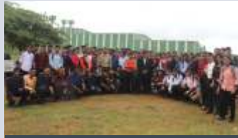
Embee Agro Foods, Davangere (India's 3rd Largest Rice Mill)