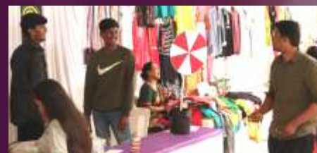
"Samhiti" The Flea Market Event