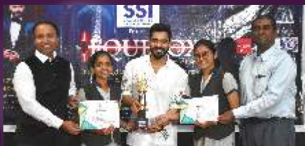
Equinox The Intercollege Event