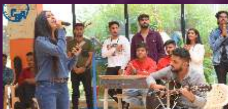
"CBA's Got Talent" The Cultural Event