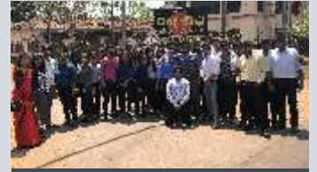
Laxmi Coffee, Coorg