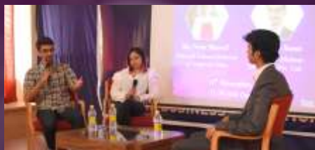
Interaction with Notable Alumni