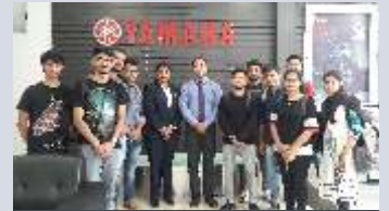
Yamaha Outlet, Hubli

"IN EVERY SUCCESSFUL STORY YOU WILL ALWAYS FIND SOMEONE WHO HAS MADE A COURAGEOUS DECISION"