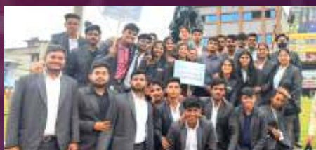
"Rotaract Club" Social Awareness Activity