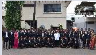
Parle-G (World's Largest Selling Biscuit Brand)