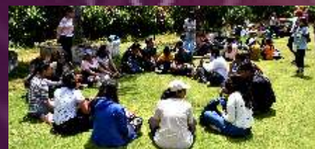
"Utkarsh" The Induction Program